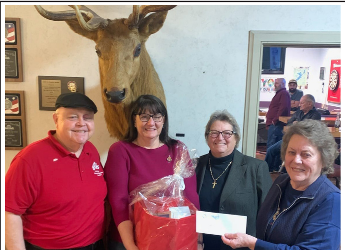
THE LAKE HOPATCONG ELKS DONATED $5,000 TO OUR AREA FOOD BANKS, HELPING ENSURE NO ONE GOES HUNGRY IN OUR COMMUNITY.