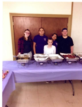
Mother's Day Brunch